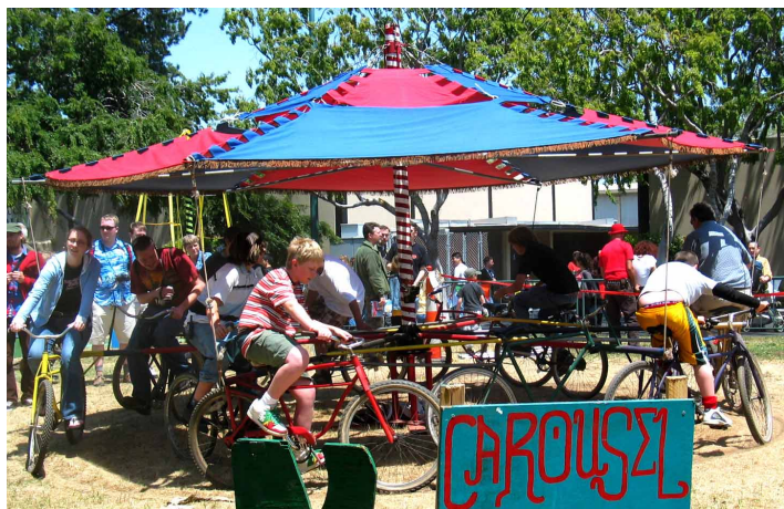
Human-powered carousel at 2007 Maker Faire

I’ll need a list of which Scratch games or movies you would like to have displayed. I’ll want to have both the name of the Scratch file and who created it.